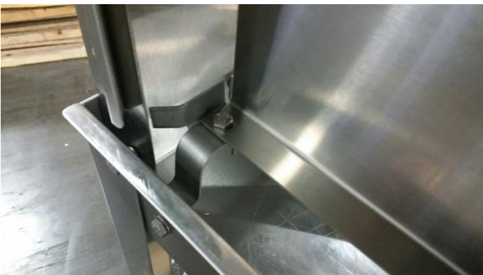
Tray track may need to be lowered to fit shield inside