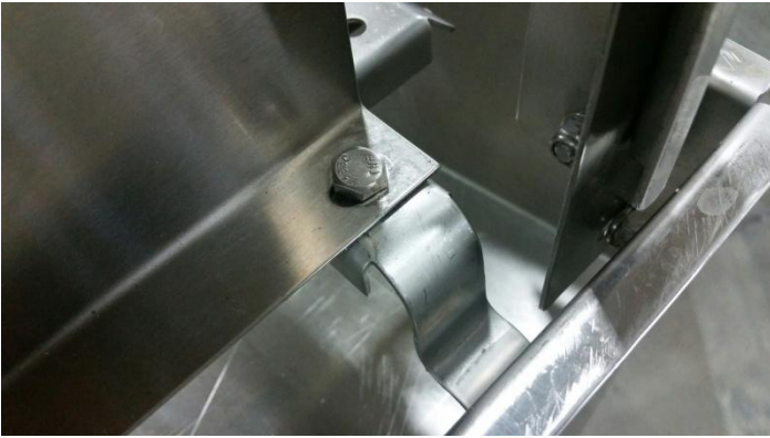
Fasten the bolt and locknuts on the tray track