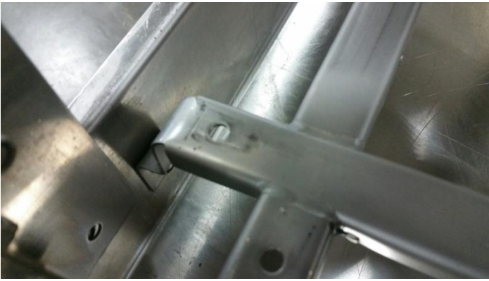
Lower forward mounting hole from tray track