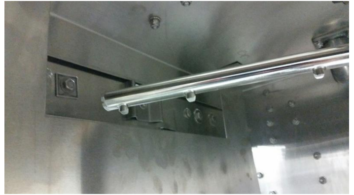
Make sure the upper spray arm clears shield