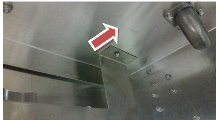
Note: shield tabs should point inward