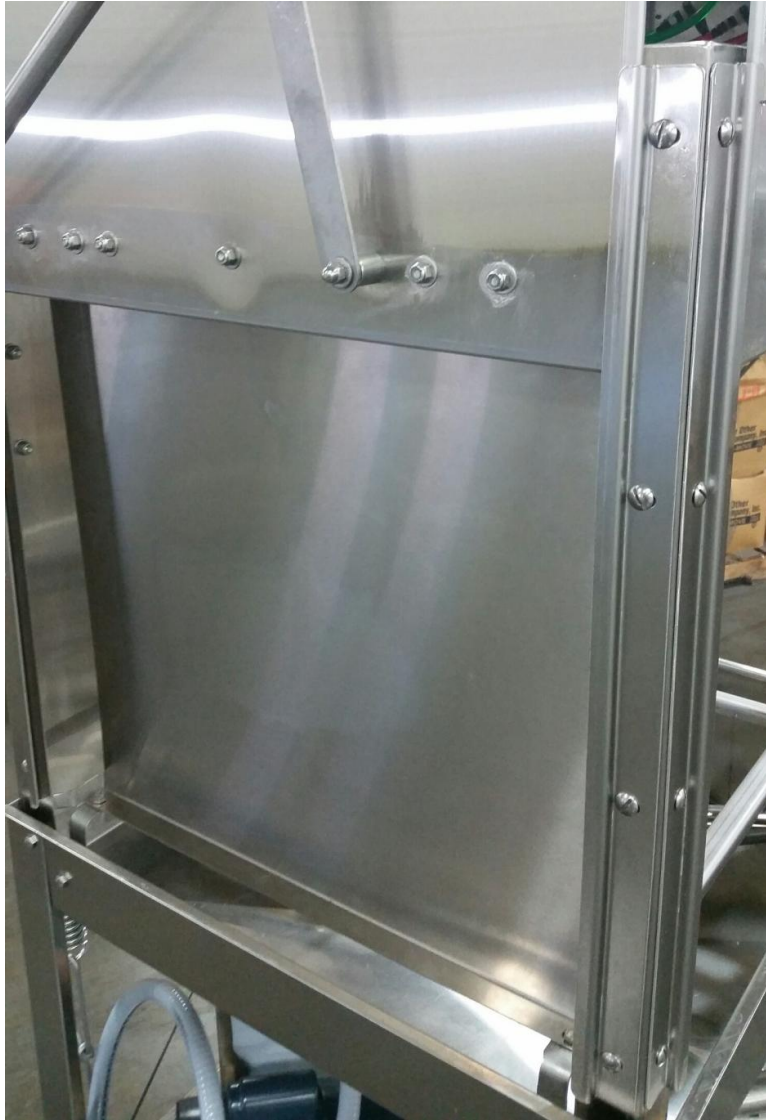
Showing finished install of shield