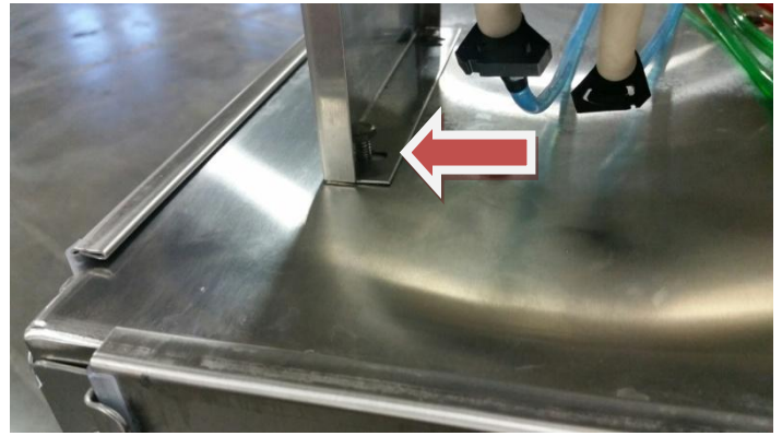
Upper forward mounting hole is control box bolt